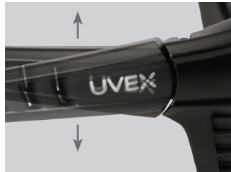
Temple and ratchet